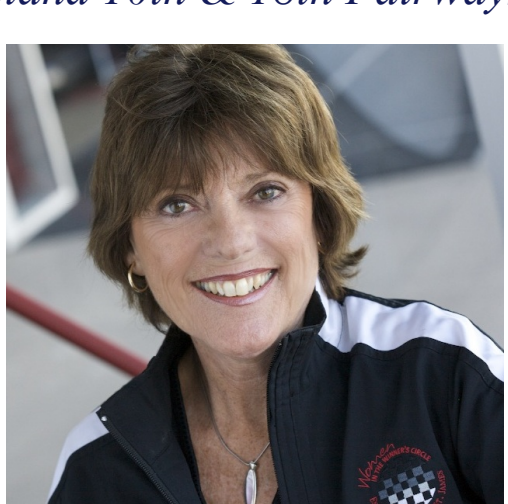
2021 Honoree Lyn St. James