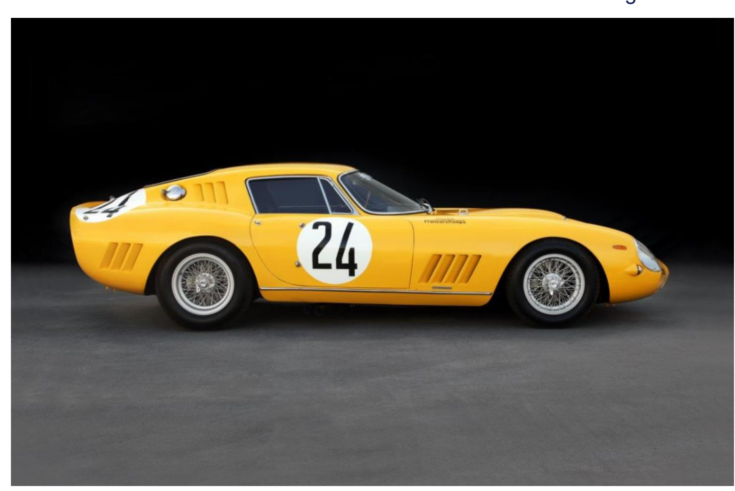
Photo: Ferrari 275 GTB Berlinetta Speciale.

Jacksonville, FL – The Ferrari 275 GTB/S that won the GT class in the 1965 24 Hours of Le Mans will be featured in the special class saluting the Ferrari 275 GTB at the 26th annual Amelia Island Concours d'Elegance.